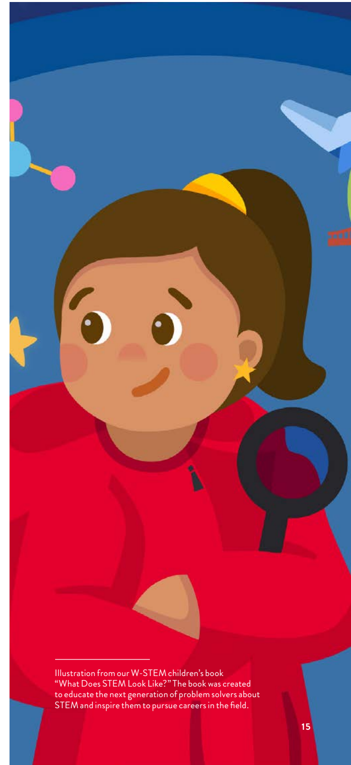
Illustration from our W-STEM children’s book “What Does STEM Look Like?” The book was created to educate the next generation of problem solvers about STEM and inspire them to pursue careers in the field.

Firsthand (formerly Vault) has ranked us the #1 health sciences internship program for college students for the past five years.